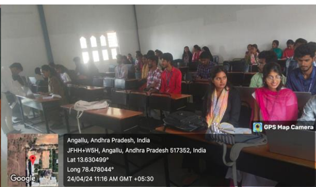
Internal Project Expo Banner Inauguration