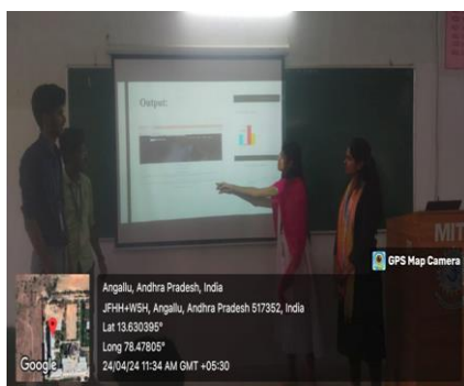
Presentation by the Participant Team

The participant teams were directed to the respective panels headed by the Domain experts for presentations. The Expert panels rigorously evaluated the various teams based on various criteria like Innovation, Implementations and Economic benefits to the mankind etc.,