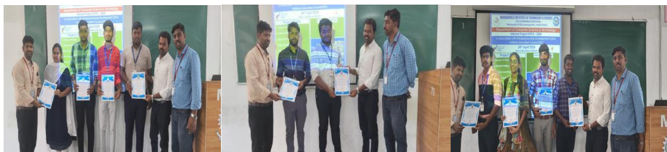
First Prize Winners